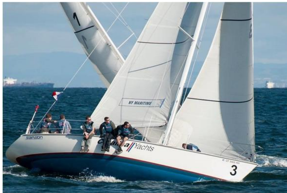
Offshore Sailing Team during Los Angeles Harbor Cup Regatta

The Offshore Sailing Team took part in the Port of Los Angeles Harbor Cup Regatta, March 8-10. The team came in third after California Maritime and College of Charleston. This is the fourth consecutive year