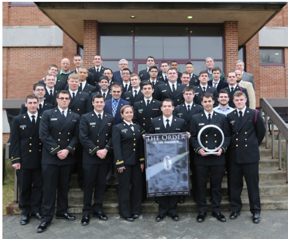
Maritime College Engineering Students at the Order of the Ring Ceremony

Department, led 37 SUNY Maritime engineering students, all of whom will complete their studies at Maritime in the coming months, as they read the oath of the Order of Engineer. It was a proud day for all. Congratulations to our engineering students!