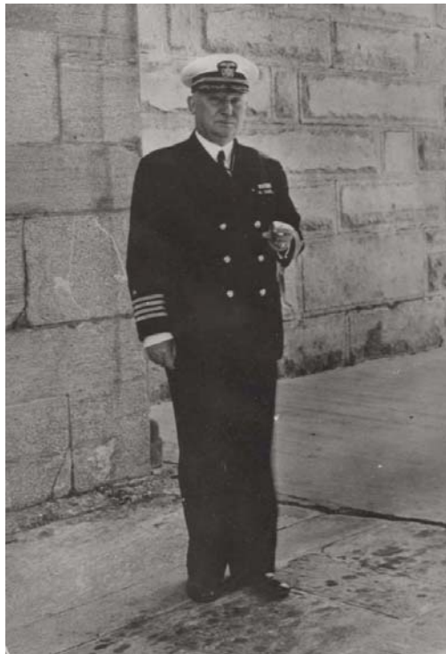
Captain James Harvey Tomb, circa 1940

The campaign was not fair as Mr. Straus concentrated the attention of the public on the lack of park facilities on the Manhattan lower east side, where parks for the poor were badly needed. The distance from the slums of the lower east side to Fort Schuyler is 17 miles via subway and bus, round trip fare 20¢ per person, taking 3 hours for the round trip. Transportation to the large Pelham Bay Park, reached by the subway, costs only 10¢ round trip. One-sixth of the total area of the Bronx, including streets, was in parks, an area out of all proportion... 22