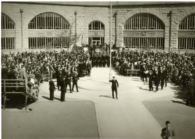
On May 21, 1938, most of the construction was complete and in a formal ceremony, the fort was dedicated as the New York State Merchant Marine Academy.

On Saturday, May 21, 1938, Fort Schuyler was dedicated as the new home of the New York Merchant Marine Academy. The total cost of reconstruction was $4,250,000 in WPA grants, not including what outlays were made by the school in their regular budget. The struggle to obtain the site, as well as the grueling construction, were some of the most tension-fraught times in the history of the New York State Maritime College. Yet there is no doubt, that the acquisition and reconstruction of Fort Schuyler by the Academy changed the face of The Bronx and allowed that school to evolve into the Maritime College.