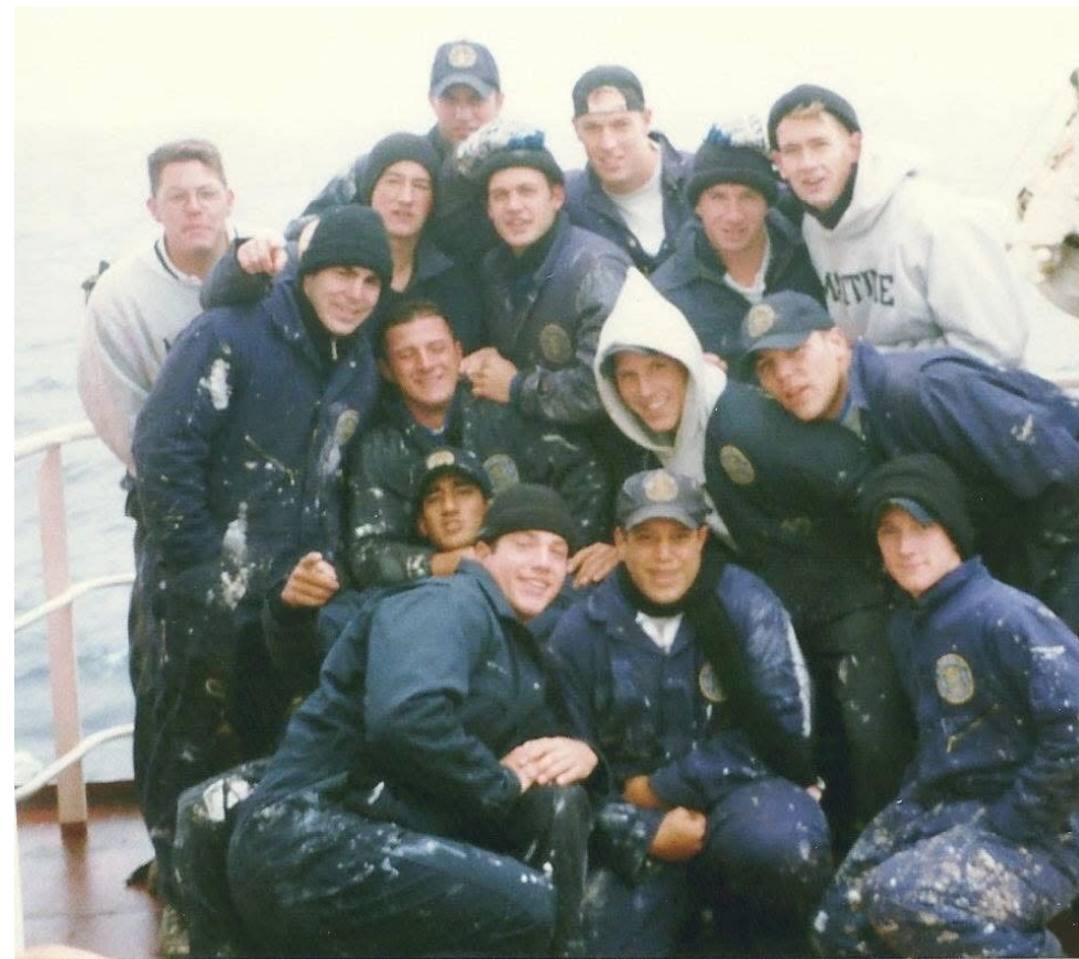
Summer Sea Term